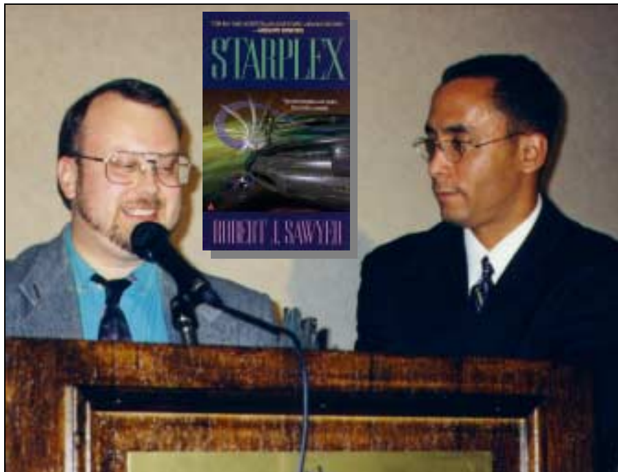
Robert J. Sawyer receives the Best Novel Aurora Award from Babylon 5 star Richard Biggs.

popular American science-fiction television series Babylon 5 .